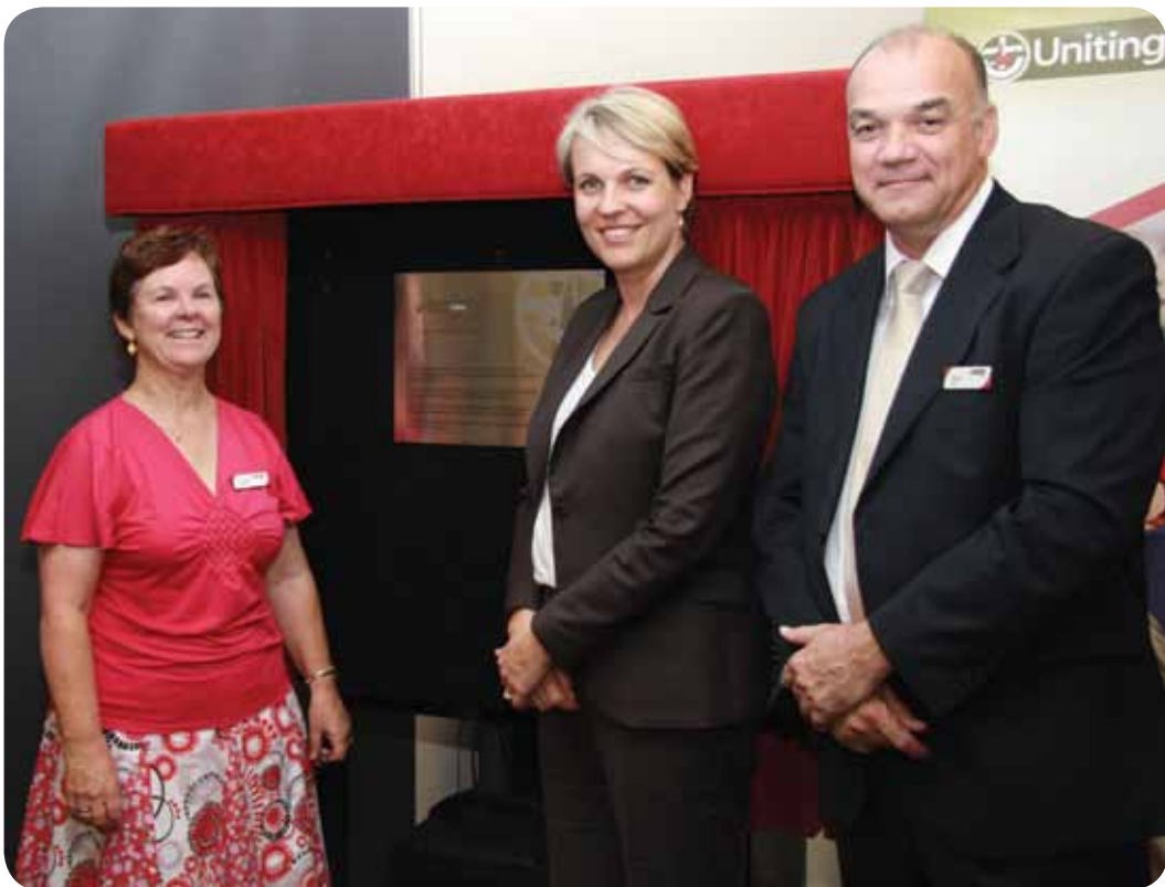
The Honourable Tanya Plibersek, Minister for Housing and for the Status of Women

unveils the plaque at the official opening of UnitingCare West's Merriwa Service Centre.