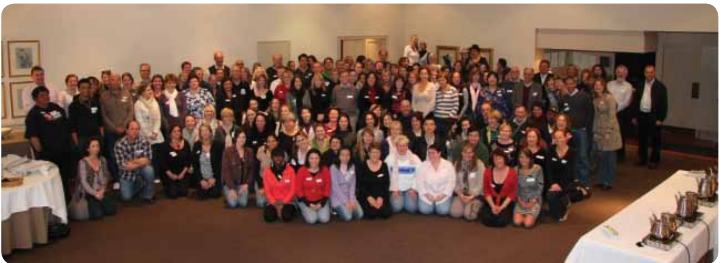
A group shot from UnitingCare West's all staff and volunteers away day held in July.

DID YOU KNOW? UnitingCare West has over 250 staff and 150 volunteers.