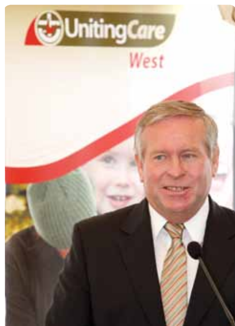
Premier Colin Barnett at the official opening of the Inner City Service Centre in February.

UnitingCare West has again experienced an increase in demand across all our services with economic and social pressures increasing the numbers of families and individuals experiencing family breakdown and conflict, parenting issues, financial difficulties, domestic violence, mental health issues, homelessness and substance abuse. Many are first time users of our services – an indication of the increase in need in the community and the high profile of UnitingCare West. UnitingCare West has increased the size of its operation by approximately 25% in the past year.