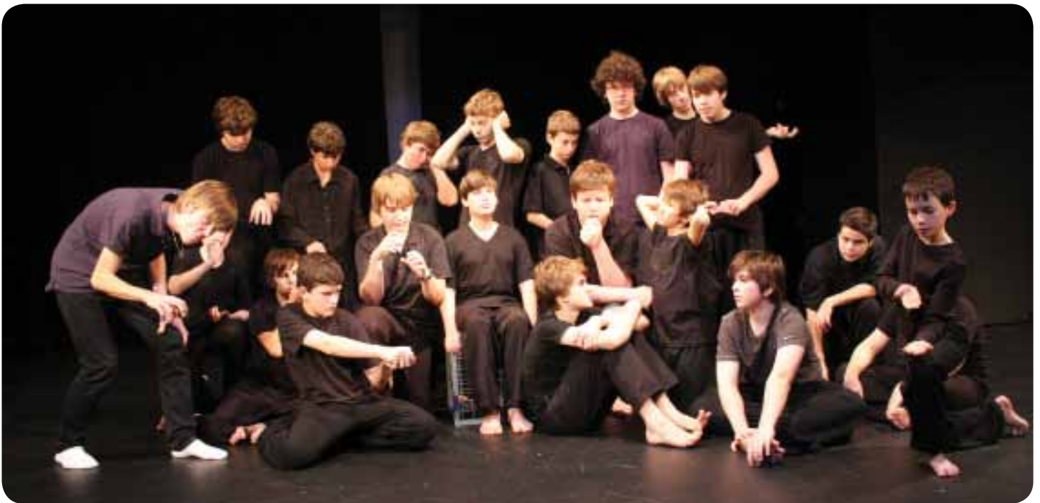
Students from Scotch College performed a physical theatre piece on homelessness for the Winter Appeal launch in June.