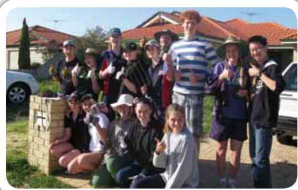
Ballajura Blitz: St Stephen's students roll up their sleeves to create a renewed and enjoyable front yard for UnitingCare West's disability group home. The students will return in October to conclude the blitz.

The Ballajura Blitz project has been the culmination of 12 months hard work, including fundraising $850 for garden materials, designing the landscape of the area and advocating for the needs of disability group homes.