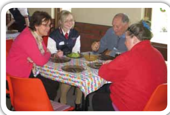
Sharing a meal: St Stephen's students socialised with Rainbow participants during a luncheon in Duncraig. This relationship with students is set to continue in 2012.