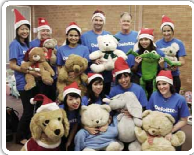
Being Santa: Deloitte staff at the Operation Santa workshop packed gift and food hampers for Perth families in need.