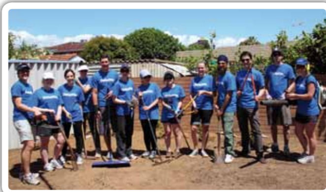
Getting stuck in: Volunteers give the garden an overhaul at a women's refuge. The makeover included weeding, adding new plants and mulching both the front and back yard.